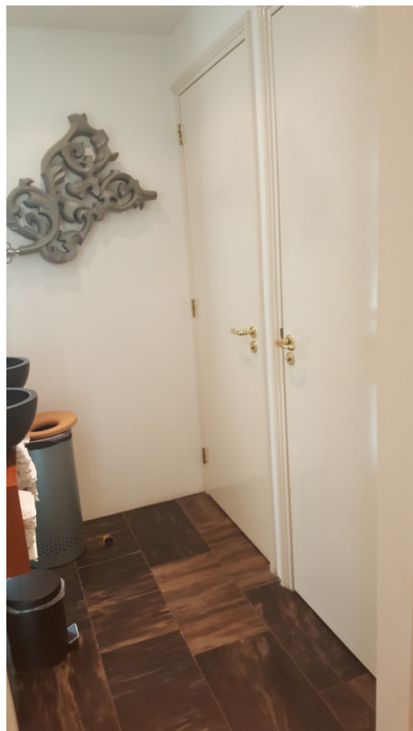
Entrance Ladies toilet