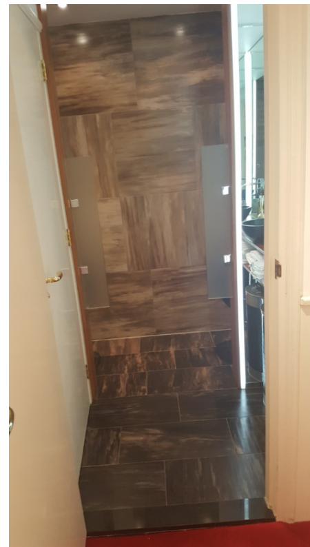
Entrance Men's toilet